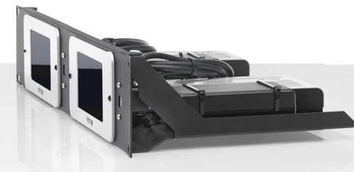
4 | TM3-MA2U equipped with TM3-3G and TM3