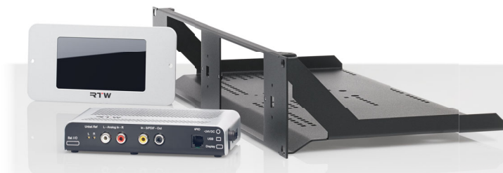
3 | TM3 with TM3-2U to be mounted into TM3-MA2U

TM3-2U option. Pictured are examples for mounting the devices into TM3-MA2U.