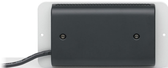
1 | Rear view of TM3 with TM3-2U option

TM3-3G, or TM3-3GS device. Then, a display with mounting frame, mounting material, and an USB extension cable is part of TM3 delivery instead of the table-top TM3 display unit.