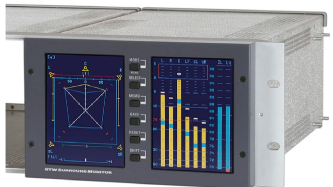
10860-VID with 5.1 surround peak meter, total SPL, Leq(A) and surround sound analyzer (left display) for monitoring the balance of surround programs.

After the unit has been installed in the rack the analog and digital audio signals are connected with two 25-pin